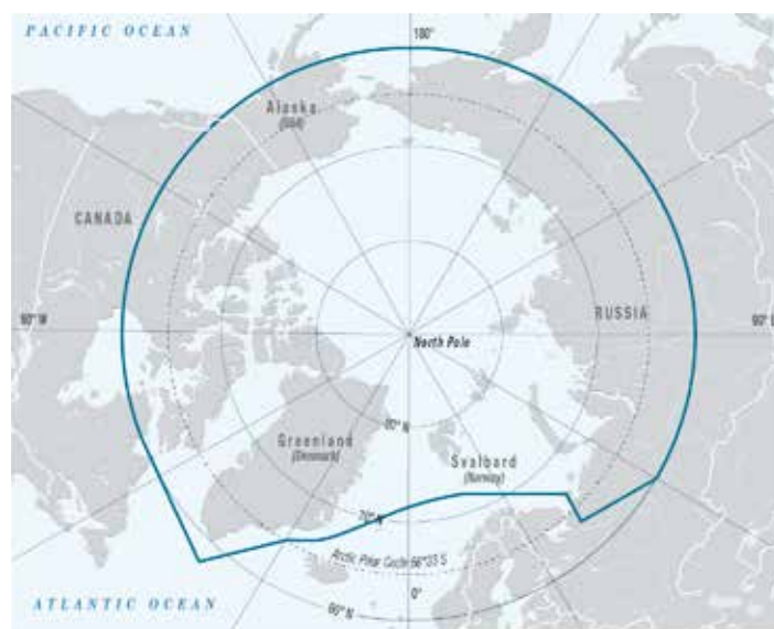
Figure 2 - Polar Code areas in the Arctic.